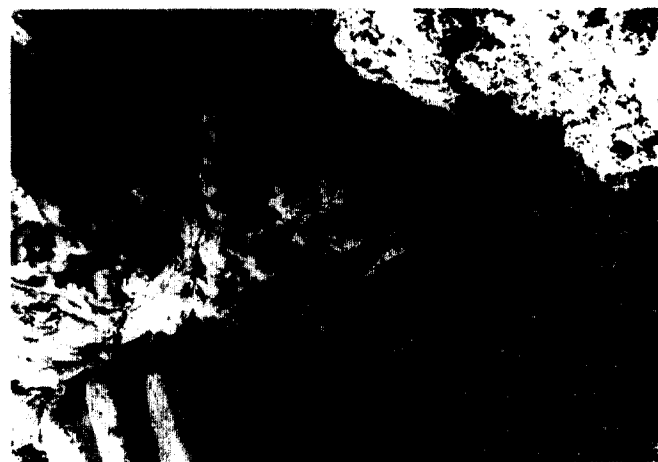
Fig. 2. Tapeworms in the ruptured caecum.