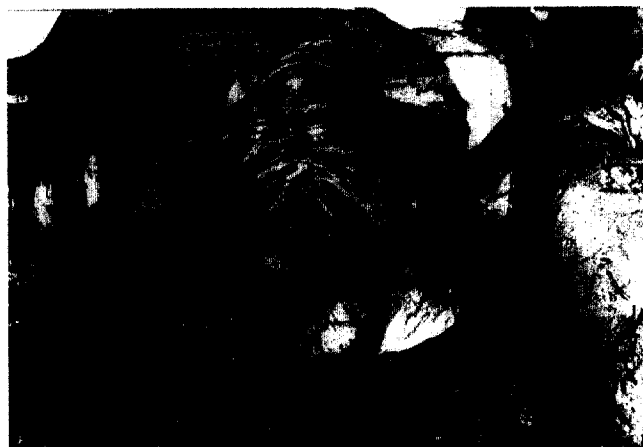
Fig. 1. Ruptured caecum secondary to unresolved caecal impaction.

Questions remains to be answered. At what infection intensity does A perfoliata become a risk factor for colic? Since the present case, a horse was reported to have died from exercise induced pulmonary hemorrhage during training. Necropsy revealed tapeworms and a mild impaction. Could the lung be under much pressure by tapeworm induced impacted bowels piston movement during training or racing?