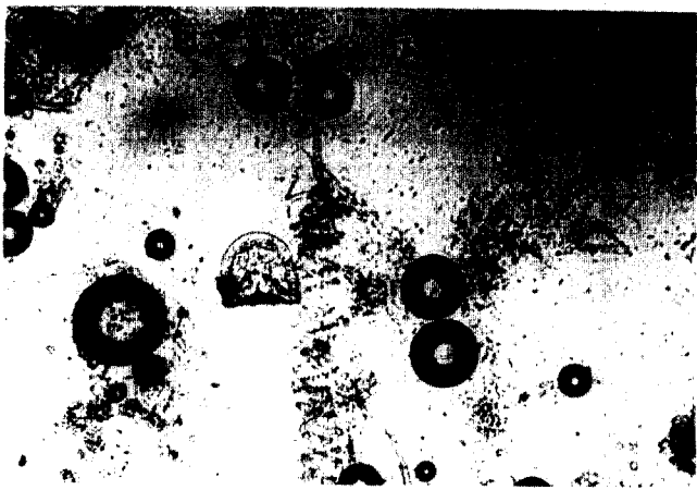
Fig. 4. Round to D shaped egg of A. perfoliata .

The major findings of this study conclusively show the presence of A. perfoliata in South Korea and the suspected association between colic and the intestinal tapeworm A. perfoliata . The results of this study indicate the need for an epidemiological survey of colic and a clinical trial to evaluate the protective role of anti-cestode anthelmintics against colic.